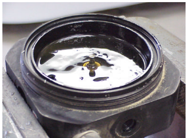
Photo 2 – Oil condensate inside regulator after approximately 35,000 miles.

Excessive compressor oil vapors in the fuel can also lead to significant system problems. As the gas expands through the regulator, the gas cools to the point where oil vapors in the fuel can condense and precipitate out of the fuel. The oil does not cause the line blockage problems, like ice and hydrates, however the oil can migrate downstream and cause problems for the final fuel metering elements like fuel injectors. Different organic and synthetic oil precipitates can mix and gel over time, causing fuel injector blockage.