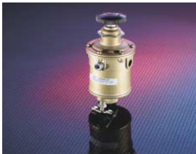
Typical Curve for 20 PSI (138 kPa) Set Pressure with 100 PSI (690 kPa) Supply